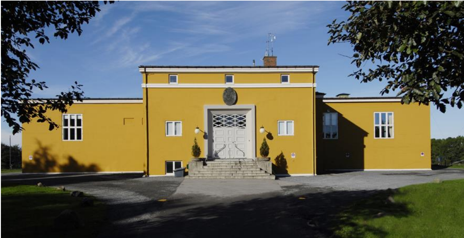
Jeløy Radio, buildt 1937 - Telefunken Moss