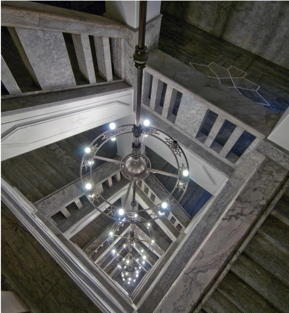
Kongens gate 21 i Oslo, 2012